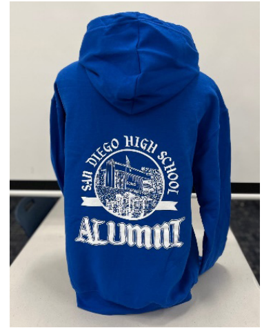
Blue Hoodie (Pullover or Full Zip)